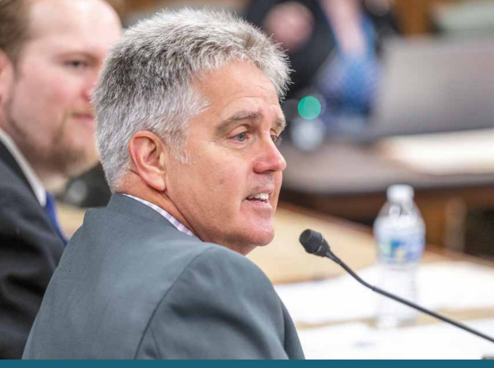
Rep. Conklin oversees proceedings of the House State Government Committee as majority chairman.